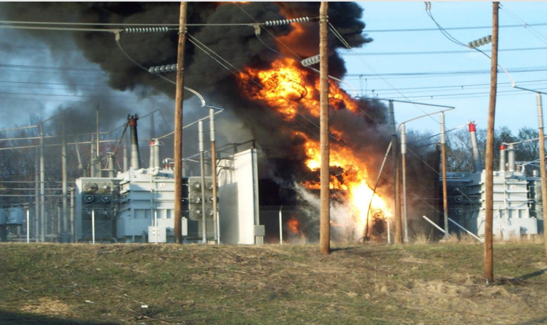
500 kV Transformer Failure in 2000