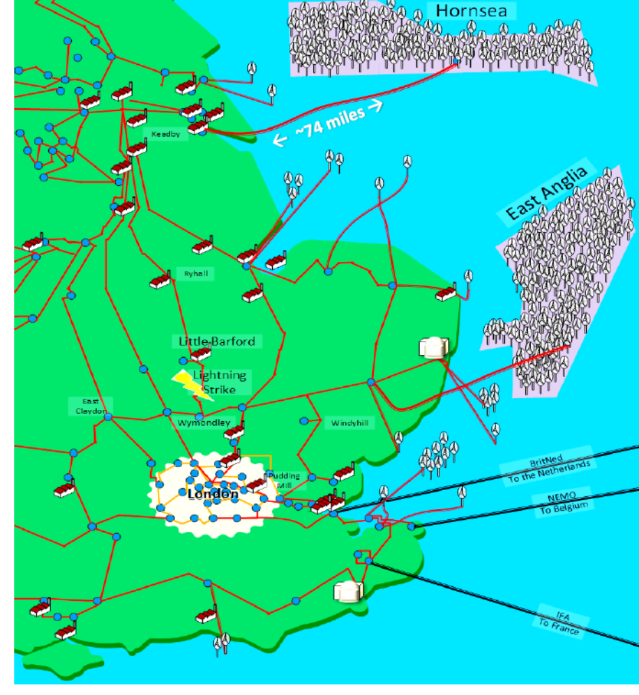
Figure 1: Simplified Transmission Map for SE Britain [1]