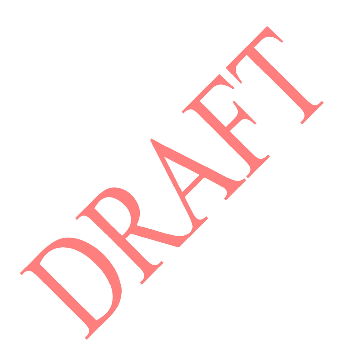
in the PJM Manuals associated with the Permissible Technological Advancement before the close of Decision Point II.